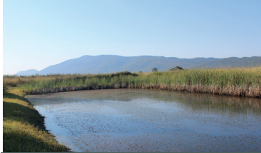
Pond in Konavle field