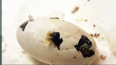
Hatching of the Balkan Terrapin