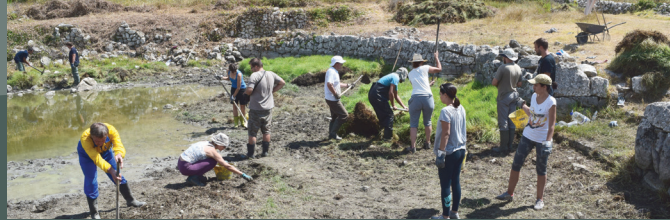
Volunteer cleaning action at Majkovi pond